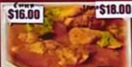
Curry Masala (Chick/Lamb/