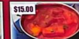
Paneer Tikka Masala