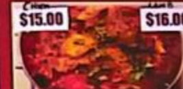
Chicken Bhuna (Chick/Lamb)