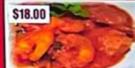
King Prawn Masala