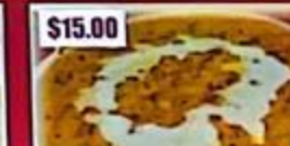
Methi Matar Paneer