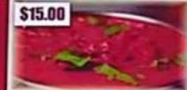
Chicken Tikka Masala